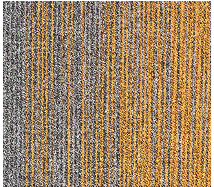
COBALT CREATIONS 6384249