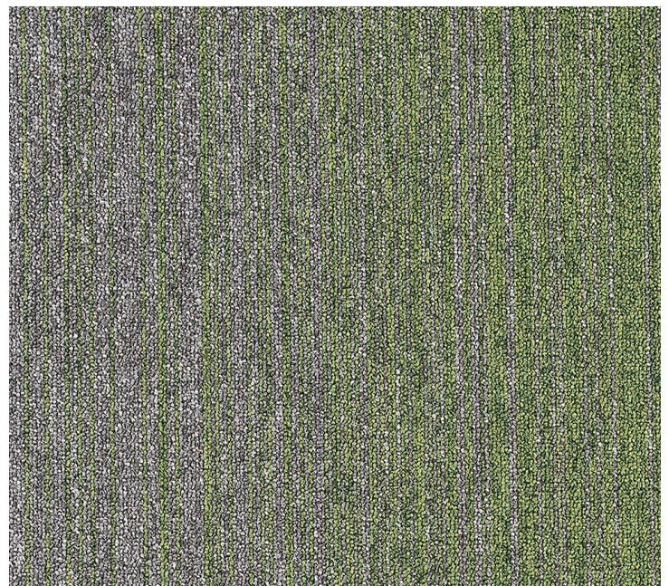
COBALT CREATIONS 6384273