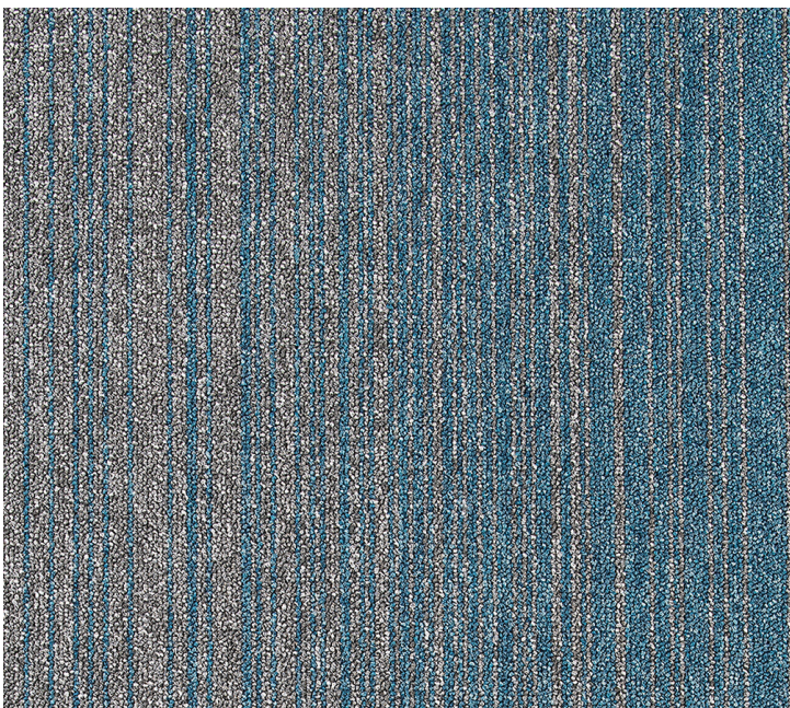
COBALT CREATIONS 6384263