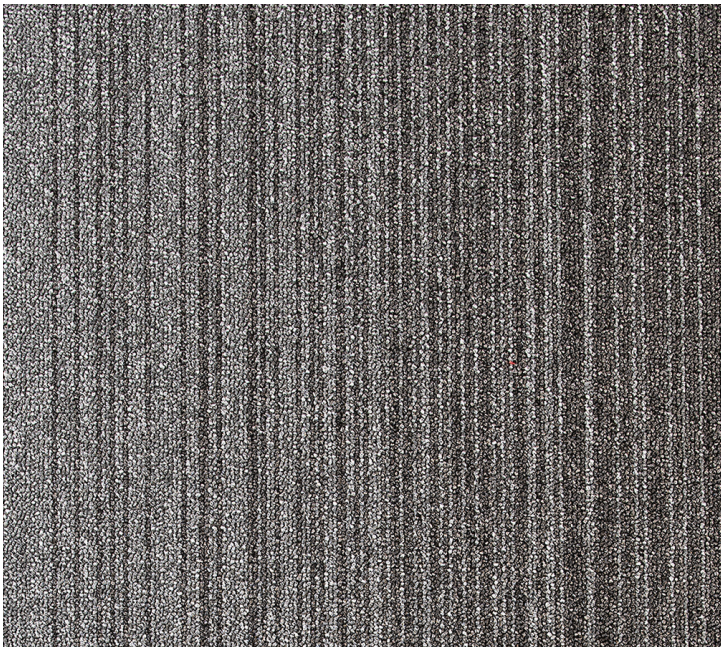
COBALT CREATIONS 6384250